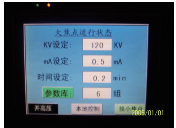
大焦点 Large Focus